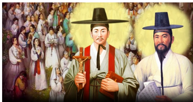
St. Andrew Kim Taegon & Companions, Korean Martyrs September 20 th