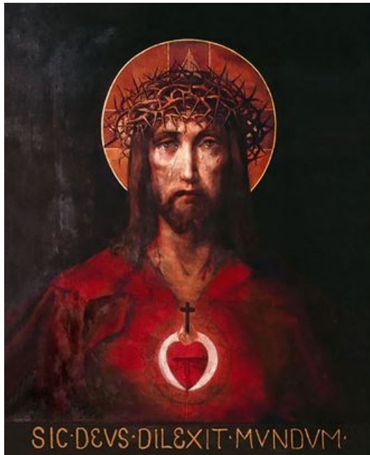
Sic Deus Dilexit Mundum Unknown artist (c. 1700s)